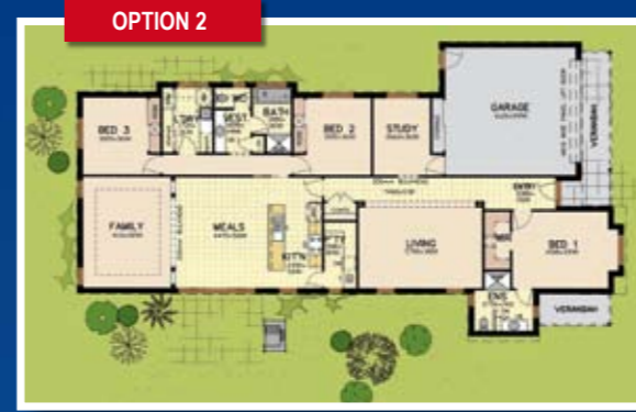
OPTION 2 Option 2 - is a plan that can be tailored to suit your individual needs. The alfresco area has been excluded to allow your own design for outdoor entertaining. Please refer to individual specification.