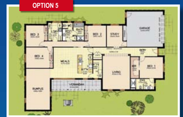
OPTION 5 Option 5 - has been created for the growing family, which includes 4 bedrooms, study, larger ensuite with walk-in robe, living area, meals area and a generous size rumpus room. In addition, this design embraces a more contemporary facade.

Barry Walker Homes present the Ashwood, a modern home for the Australian family.