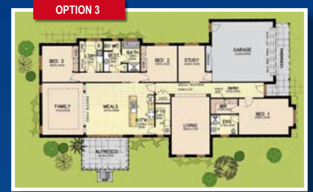
OPTION 3 Option 3 - is a larger version. The main focus is the master bedroom which has been increased in size and incorporates a generous size ensuite with a traditional walk in robe. The living room has been re-positioned within this design but still keeps its original size and functionality of the traditional Ashwood.