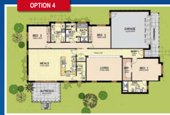
OPTION 4 Option 4 - has been created for the first home buyer or someone wishing to down size. This design still offers all the quality features of the Ashwood, and incorporates a spacious master bedroom with ensuite and walk-in robe.